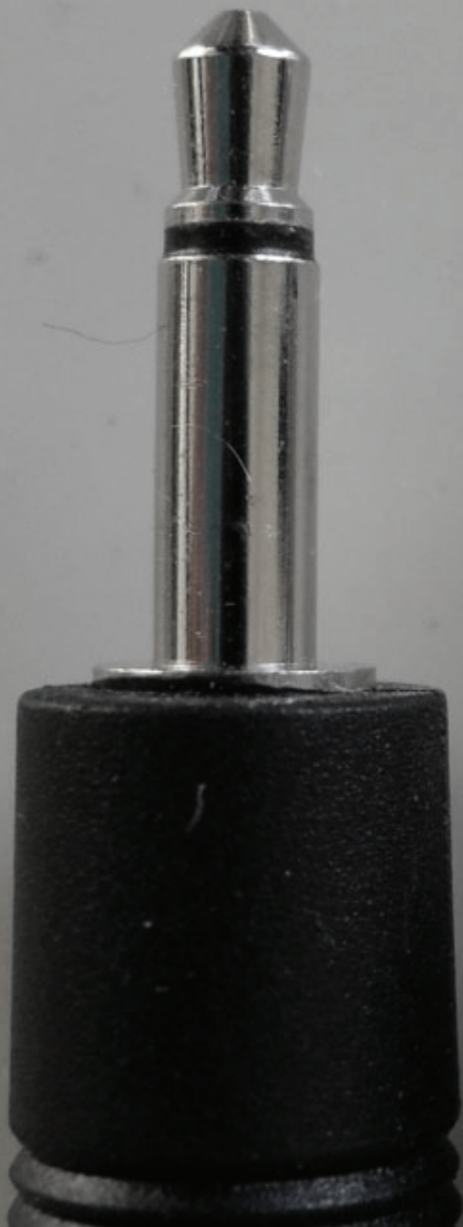
Tini Jax plug