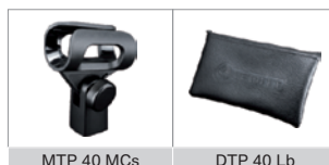
MTP 40 MCs